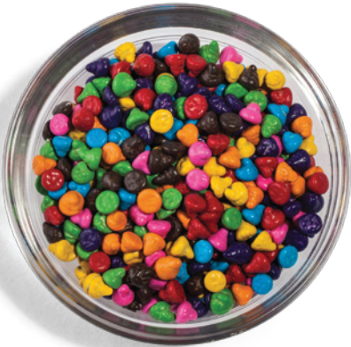
Rainbow #8 FG-140012

Contact us today for more information at sales@paulaur.com .