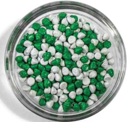
St. Patrick's Mix FG-140014