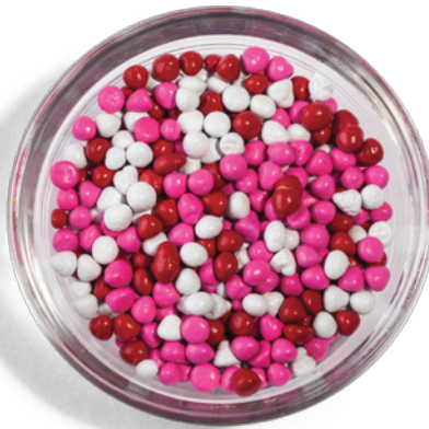
Valentine Mix FG-140013