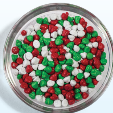
Jingle Mix FG-140020