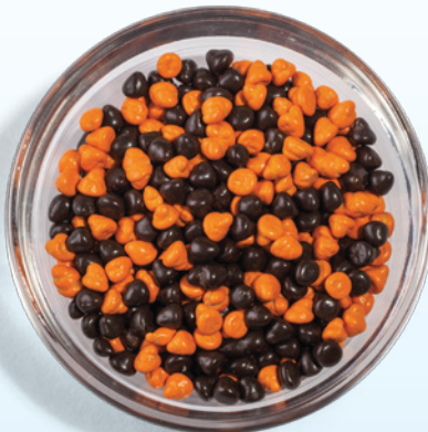
Halloween Mix FG-140017