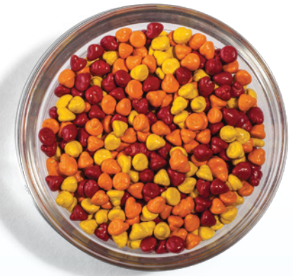
Harvest Mix FG-140018