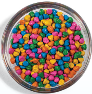
Pastel Mix FG-140048